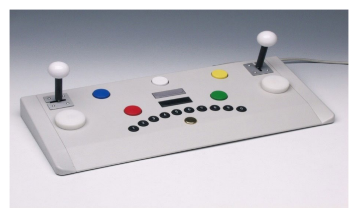
Figure 2: Response Panel, Universal.