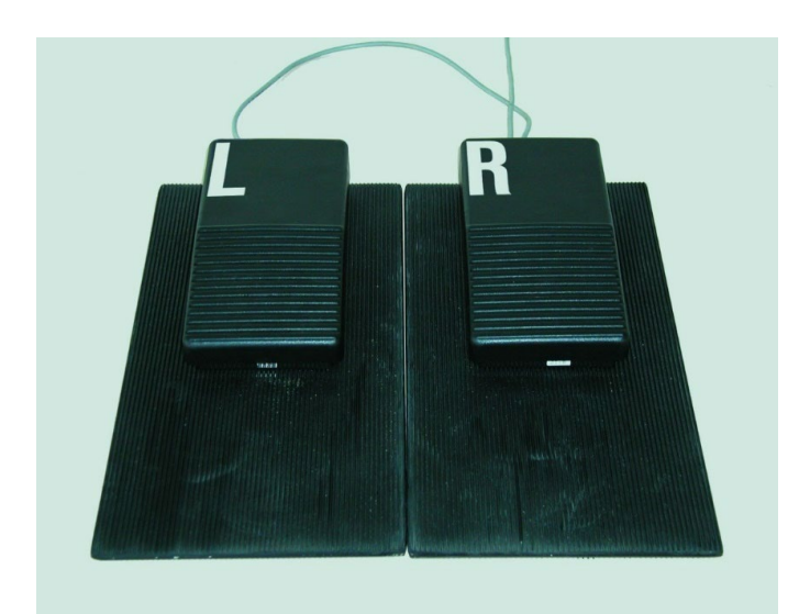
Figure 3: Digital Foot Pedals.