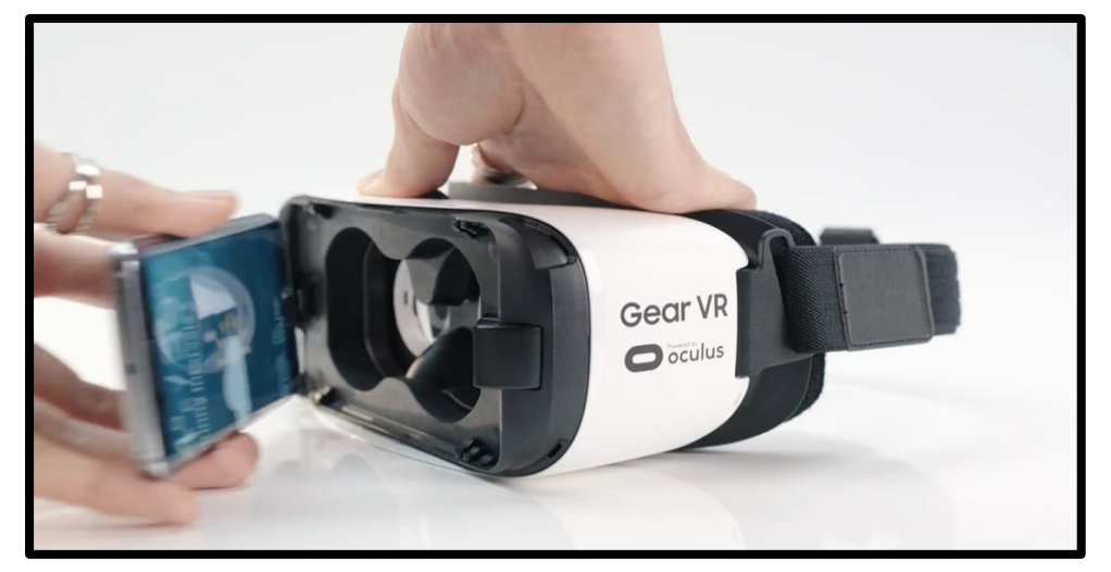
Appendix 2: Shows the Virtual reality glasses.Appendix 3: Shows the list of experts.