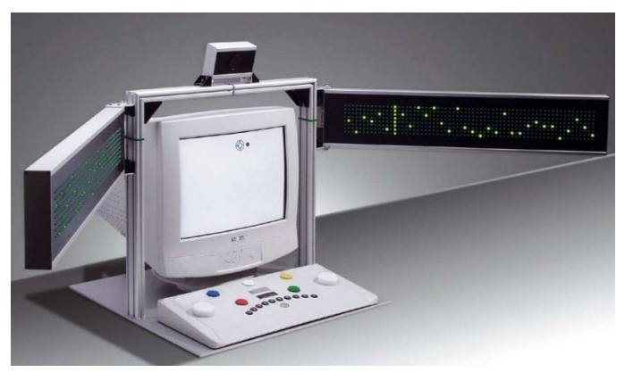
Figure 1: An illustrative picture of the main device for the peripheral perception test.