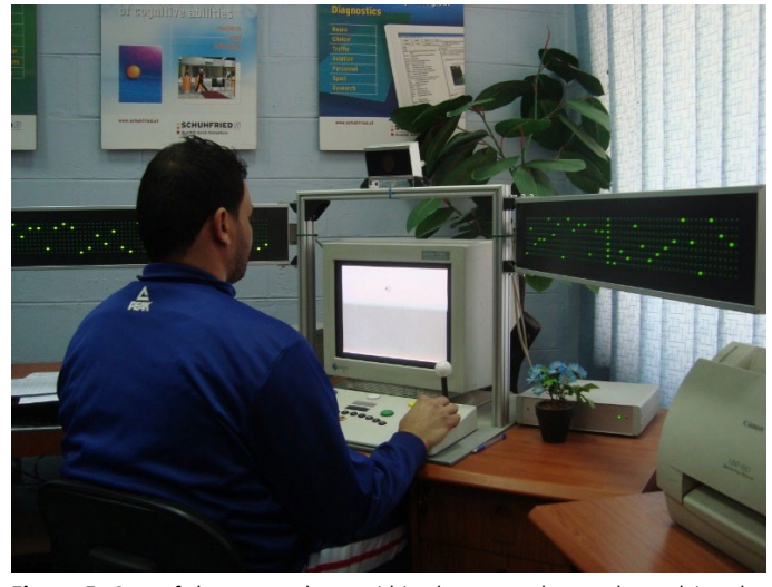
Figure 5: One of the respondents within the research sample applying the Perception Test.

As for the fattest subjects, it is not usually possible to measure the field of vision to 180 degrees because they will be sitting farther from the computer screen; therefore, their eyes will be placed beyond the ends of the wings. In such cases, the maximum visual field cannot be measured (this applies to all individuals who sit far from the computer screen).