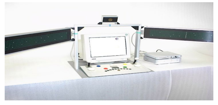
Figure 4: Correct setup and placement of the peripheral perception device.